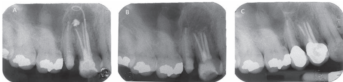
Figure 1 (A) A preoperative radiograph of a maxillary first premolar with a periradicular lesion. (B) A postoperative radiograph of tooth underwent apical surgery. (C) The radiograph taken at the 2-year recall exhibits a complete resolution of the periradicular endodontic lesion. The tooth is classified as healed.

After the introduction of microsurgical principles and new materials for apical obturation in endodontic surgery (i.e. Calcium Silicate materials) healed rates of apical surgery with root-end filling improved. 20 Calcium silicate demon-