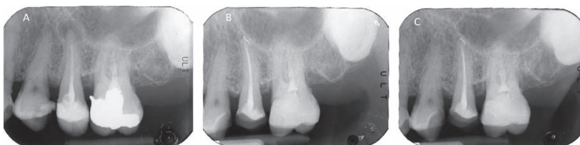
Figure 3 (A) A preoperative radiograph of a first mandibular molar with a periradicular lesion. (B) The radiograph taken at the 6-month recall of tooth underwent orthograde retreatment. (C) The radiograph taken at the 2-year recall. The tooth is classified as healed.