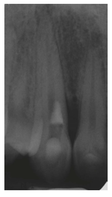
Figure 12 Intra-operative periapical radiograph showing the MTA place in the resorption area.

radiograph was acquired to verify the quality of the MTA placement (Fig. 12).