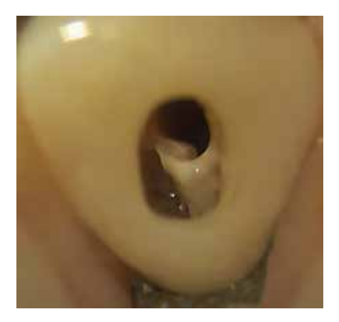
Figure 9 Clinical photograph showing the internal resorption after cleaning and shaping by ultrasonic tip under operative microscope.