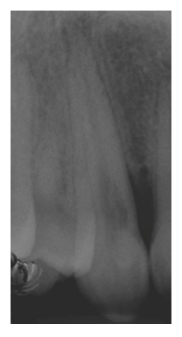
Figure 2 Pre-operative periapical radiograph showing a periapical lesion with severe internal root resorption on the right maxillary canine.

A CBCT was performed (Fig. 3) (Orthophos XG 3D, SIRONA DENTAL SYSTEMS, Verona, Italy) with a small field of view