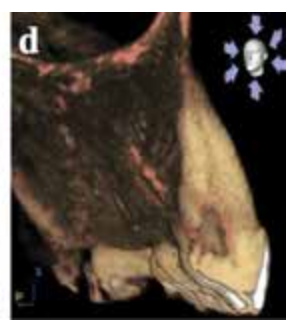
Figure 3 (a—c) Axial, coronal and sagittal CBCT cross-sections, is possible to showing the extension of the internal root resorption lesion on the right maxillary canine, the extension of periapical lesion and the septum that divide the resorption by endodontic canal. (d) The 3D reconstruction of coronal CBCT cross-section showing the resorption area with perforation of radicular walls.