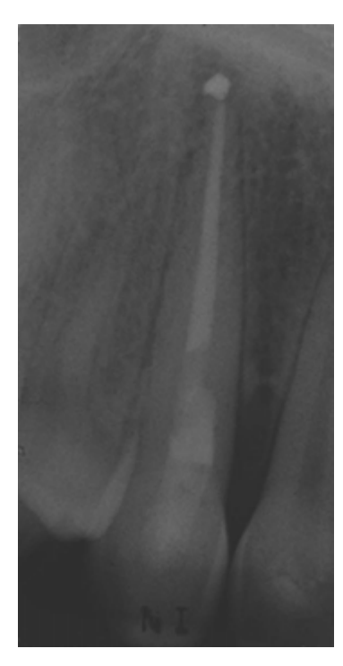
Figure 14 Periapical radiograph after 3-month showing the initial healing of periapical lesion and the essence of parodontal defect.

Between the therapy appointment the access cavity was temporarily sealed with Cavit G (3M ESPE, Neuss, Germany). At the fourth clinical session the coronal chamber was restored with a fiber post (Tech 21 cop size Isasan, Rovello Porro, CO Italy) and composite (Optibon Solo Plus Keer Scafati, SA Italy; Enamel Plus HFO mycelium Rosbach, Germany) an immediate postoperative radiograph was taken and radiographic follow up was conducted three month later (Fig. 14). Clinical examination was performed six months after proving a functional tooth without periodontal probe and inflammatory.