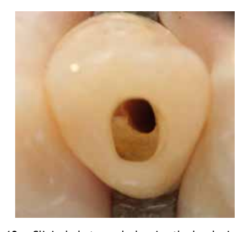
Figure 13 Clinical photograph showing the hardening of MTA.

Before the drying of the root canal after a final rinse with EDTA (E.D.T.A. 17% Ogna, Muggió, MB, Italy) and the last rinse with NaOCL, the root canals were dried with calibrated absorbent paper points and the canal was obturated with gutta percha (Dentsply, Maillefer) and Argoseal (Argoseal Ogna, Muggió, MB, Italy) using vertical compaction with heated pluggers and condensers (Calamus dual Maillefer Dentsply, Ballaigues, Switzerland).