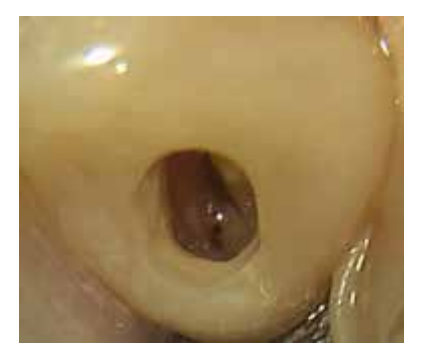
Figure 4 Clinical photograph showing endodontic access is possible see the blooding by perforation.

2% Articaine containing 1:100,000 epinephrine (Ubistesin 3M ESPE, Neuss, Germany).