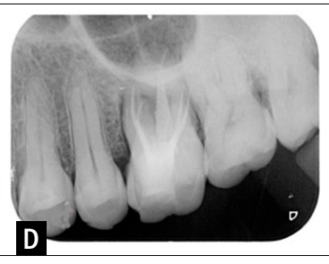
Figure 3 Operative records of the root canal treatment of the left maxillary first molar (Tooth #14) showing root canal morphology 326 MB2 DB2 P2-1. A) Intraoral photograph of the access cavity preparation: B) Intraoral periapical radiograph showing the working length determination: C) master cone intraoral periapical radiograph showing six root canals; D) postoperative intraoral periapical radiograph.

or confirm this variation. The most common configuration of such cases is the code 326 MB2 DB2 P2-1 according to the Ahmed et al system (5). The adoption of the Ahmed system for root canal classification has proven to be valuable in presenting both the number of roots and root canal configuration in a precise and straightforward manner. The accuracy of this coding system has been documented in a recent systematic review (43). One of the contributing factors to such anatomical variations is the difference in the ethnic backgrounds of the populations studied (44). Lin et al pointed out that, among nine case reports of maxillary first molars with multiple root canals published between 2010 and 2020, seven of these cases were documented in India (23). They found that the configuration of multiple canals is more frequently observed in Asian ethnic groups, with most of these cases originating from India. The current case report, featuring a patient from Nepal, provides additional perspectives that reinforce the correlation indicating a higher prevalence of multi-canal configuration in maxillary first molars among individuals of Asian ethnic backgrounds.