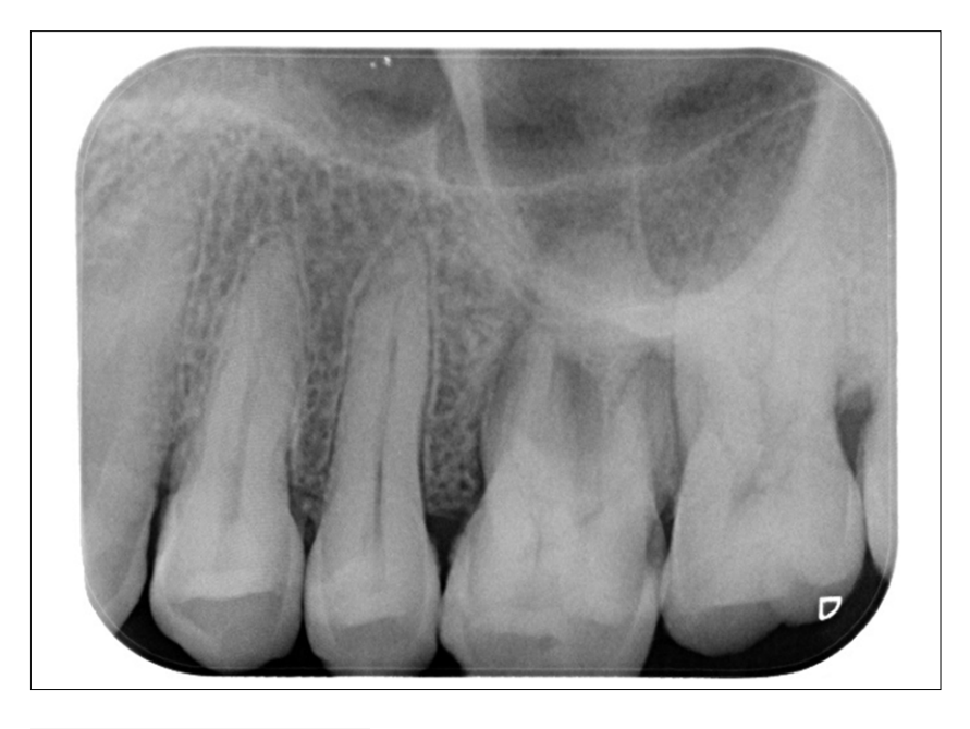
Figure 1 Preoperative intraoral periapical radiograph of the left maxillary first molar (Tooth #14).