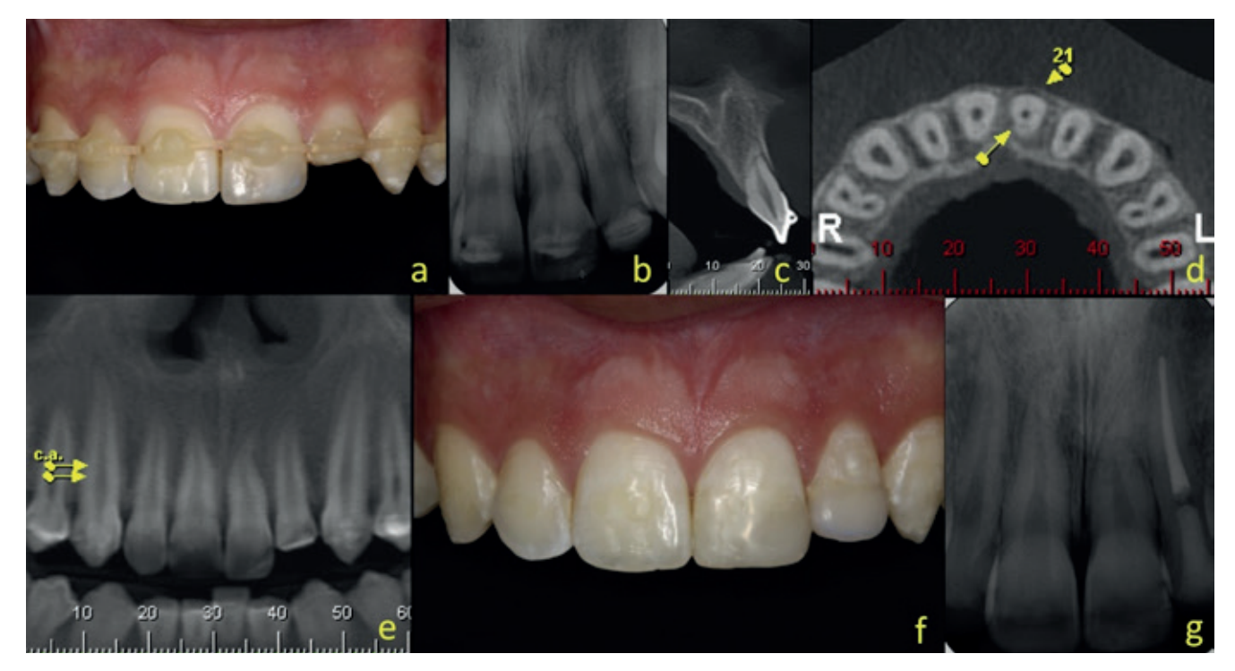
Figure 3 (a) Initial intraoral view of the case 3. (b) A preoperative radiograph showing horizontal root fracture at the apical third of the left maxillary central incisor. (c) CBCT showing the sagittal (d) axial (e) and panoramic view. (f) Clinical follow-up after 2-years. (g) Periapical radiograph at 2-year follow-up showing the interposition of hard tissue between the fragments.

Clinical examination revealed a crown fracture of the maxillary left lateral incisor, small mobility, and a smooth color alteration in maxillary left central incisor. The pulp