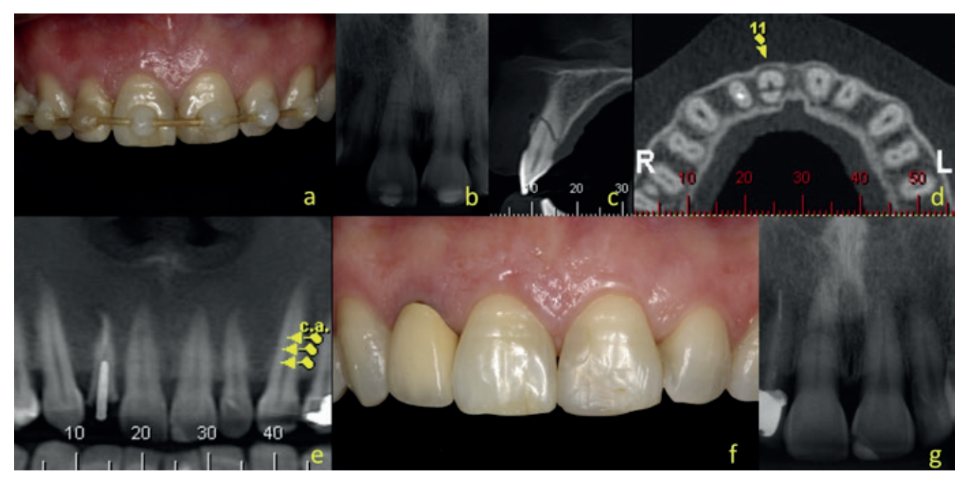
Figure 2 (a) Image obtained 10 days after the trauma. (b) Periapical radiograph suggesting root fracture at the apical third of the right maxillary central incisor. (c) CBCT showing the sagittal. (d) axial (e) and panoramic view. (f) 2-year follow-up evidencing healthy clinical appearance. (g) Periapical radiograph at 2-year follow-up displays healing of the horizontal root fracture.