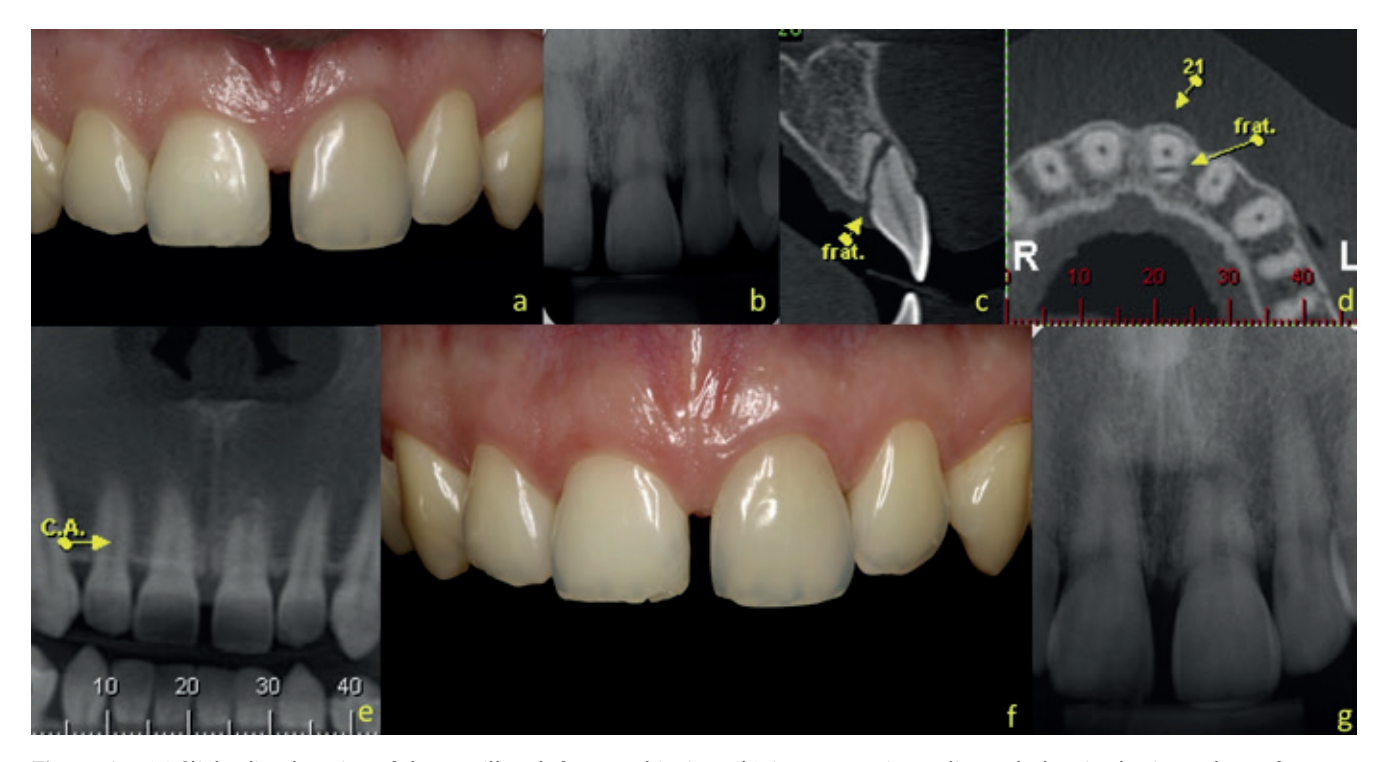
Figure 4 (a) Slight discoloration of the maxillary left central incisor. (b) A preoperative radiograph showing horizontal root fracture at the apical third of the left maxillary central incisor. (c) CBCT showing the sagittal (d) axial (e) and panoramic view. (f) Periapical radiograph at 2-year follow-up showing the interposition of soft tissue between the fragments. (g) Clinical aspect at 2-year follow-up.

Root fractures are commonly identified after some dental trauma; however, they are often asymptomatic and discovered in routine tests. In clinical cases presented, patients sought care a few days or shortly after trauma, favoring the development of a treatment plan and a better prognosis.