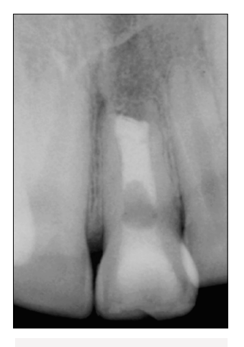
Figure 3. Radiographic image at the 3-year follow-up, showing the complete healing of apical periodontitis.

A) The internal surface of the flap was impregnated with small pieces of rubber. B) Final Radiographic image.